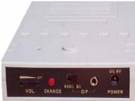
Compact Flash On Hold System

These are some examples of telephone on hold equipment options. Either of these options would suit your business depending on your current setup, budget, level of IT expertise within your organisation and intended message updating cycle.