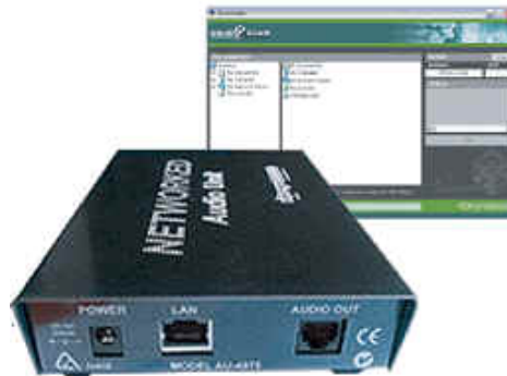
Network On Hold System

Your business can also take advantage of the following options to update your announcements: