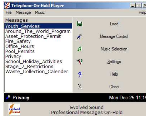
Software On Hold System

Your business should be able to take advantage of the following options to update your recorded message or music content: